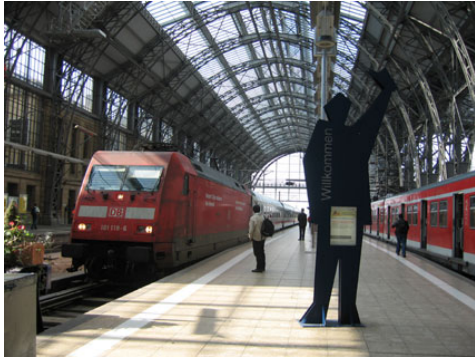
bus or train station